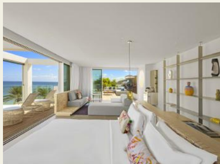
154 Rooms & Suites